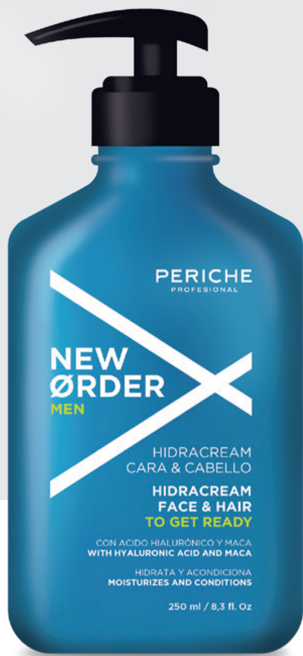
Hidracream Face & Hair