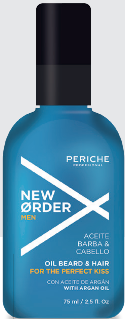
Oil Beard & Hair