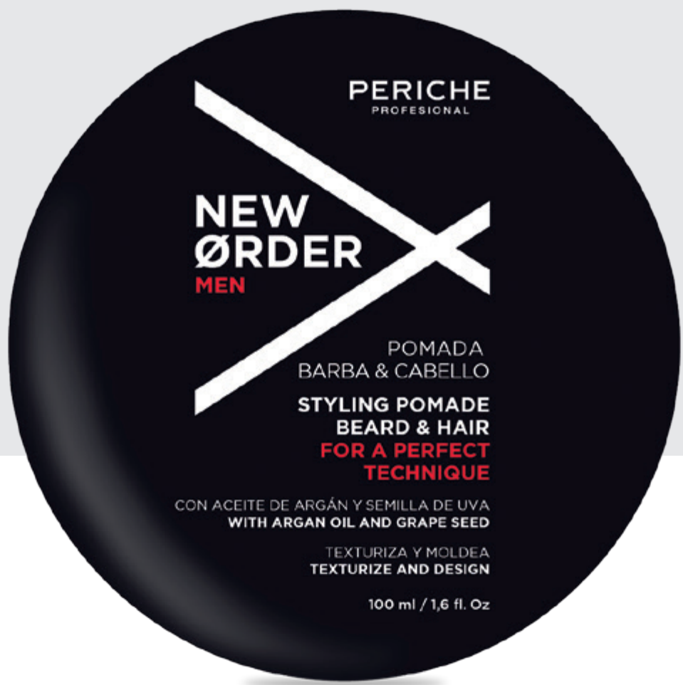
Pomade Beard & Hair